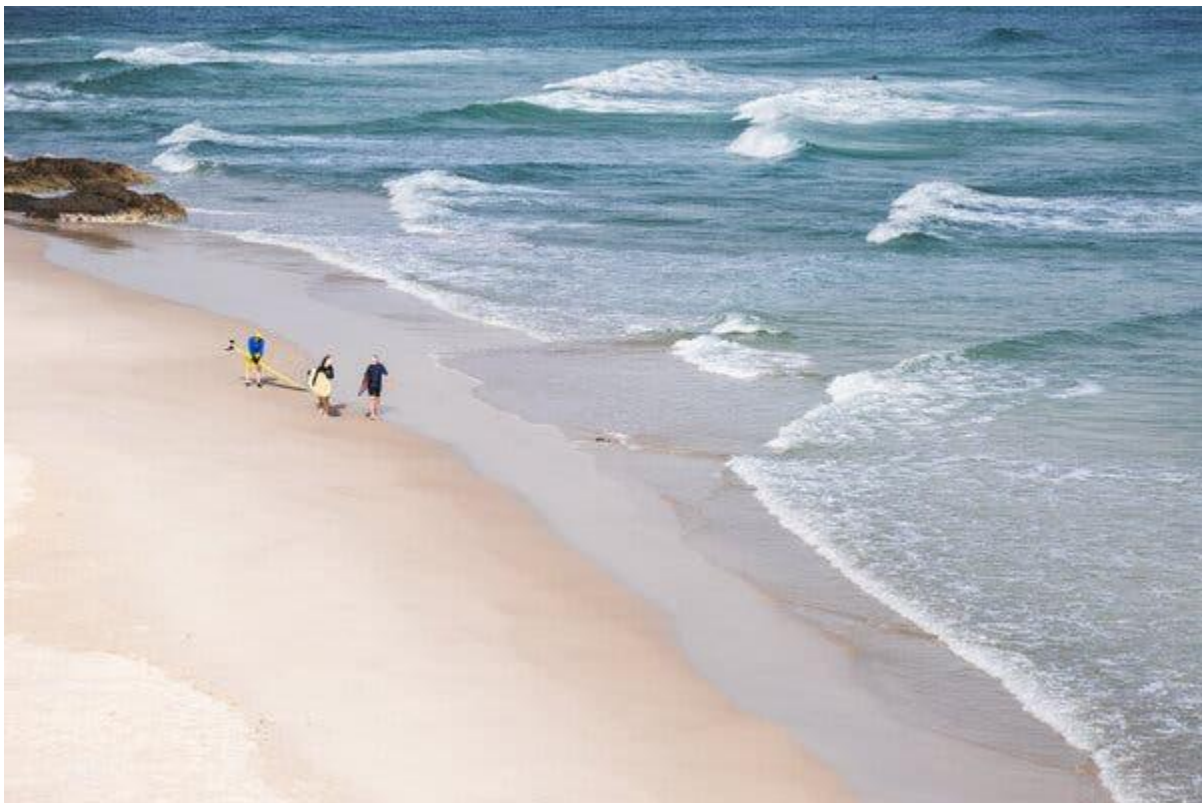
Surfers at Little Wategos Beach in Byron Bay.